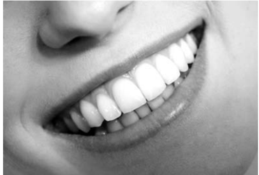
Whiter teeth after oil pulling

People who have undergone the Mouth Cleanse have also reported relief from acidity, asthma, bronchitis, cracked feet, eczema, headaches, heart